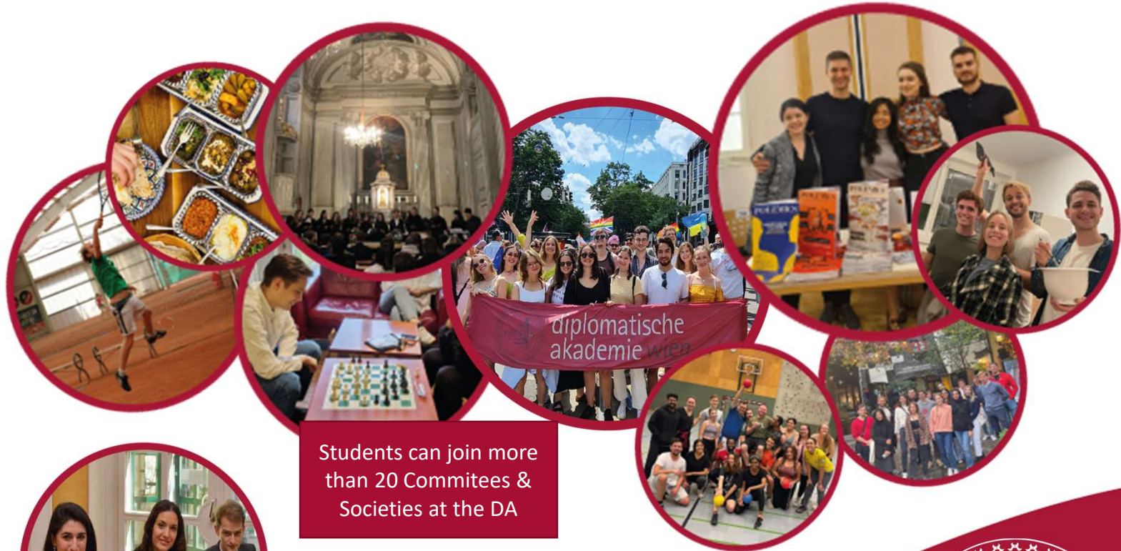
Students can join more than 20 Committees & Societies at the DA