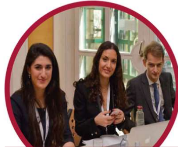
Annual conference DASICON