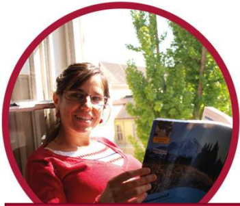
Campus in the heart of Vienna

A unique, diverse, multicultural and dynamic place to study, learn and grow in and outside of its classrooms