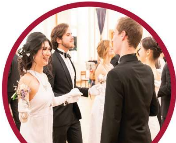
Traditional Charity Ball